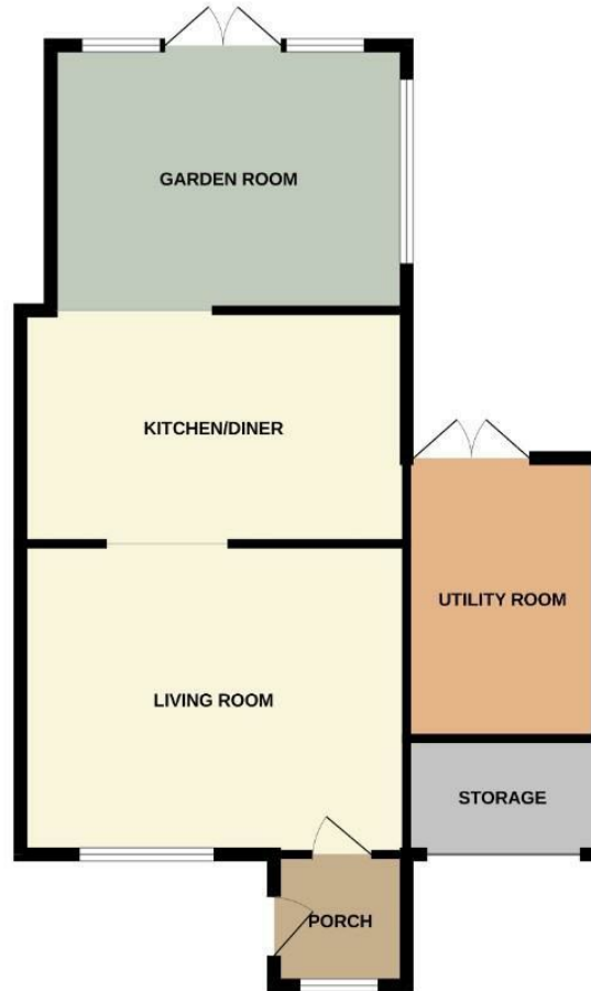
GROUND FLOOR 717 sq.ft. (66.6 sq.m.) approx.